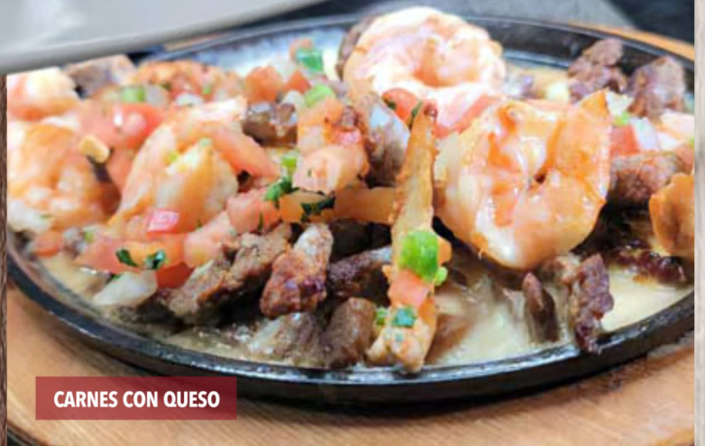
CARNES CON QUESO