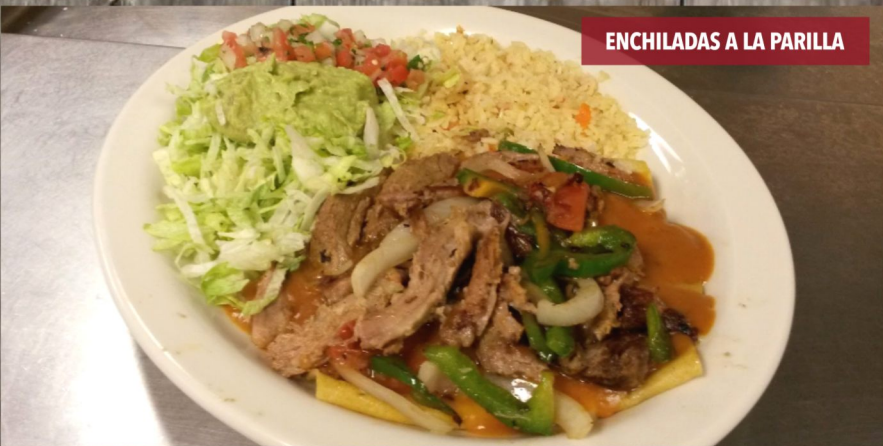
ENCHILADAS A LA PARILLA

Children 10 and under only. Drinks are not included.