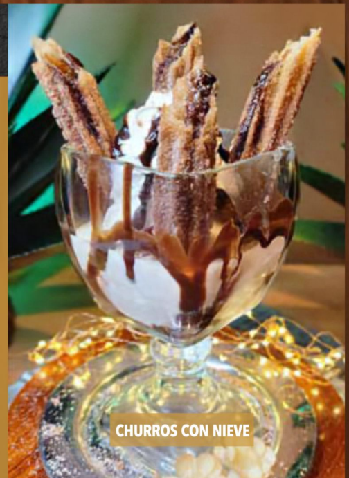
CHURROS CON NIEVE