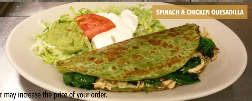
SPINACH & CHICKEN QUESADILLA

Any change to your order may increase the price of your order.