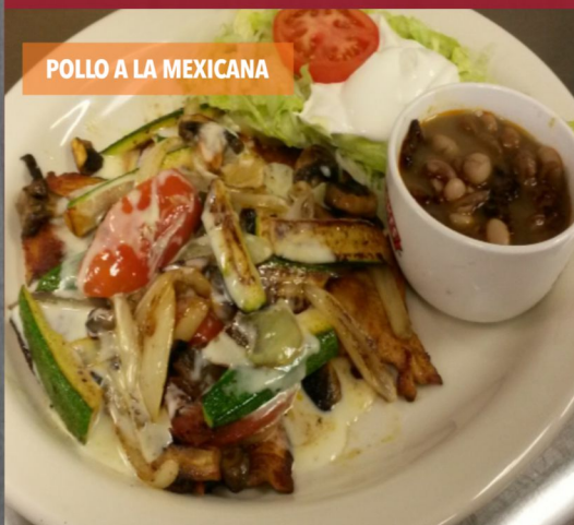
POLLO A LA MEXICANA

Grilled chicken strips cooked with onions, mushrooms, poblano peppers, in a cream base served with rice, beans, and three tortillas 14.00