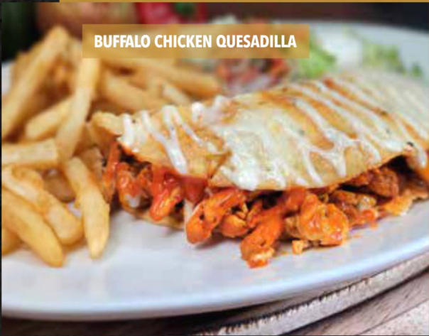
BUFFALO CHICKEN QUESADILLA