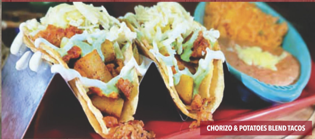
CHORIZO & POTATOES BLEND TACOS

Cheese Quesadilla, beef enchilada, and chalupa 8.75