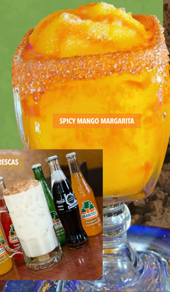
SPICY MANGO MARGARITA

Draft Beer (ask for draft selection) IMPORTED 12oz 4.25 • 21oz 7.75 32oz 9.50 • pitcher 15.50 DOMESTIC 12oz 3.75 • 21oz 7.00 32oz 8.00 • pitcher 14.25